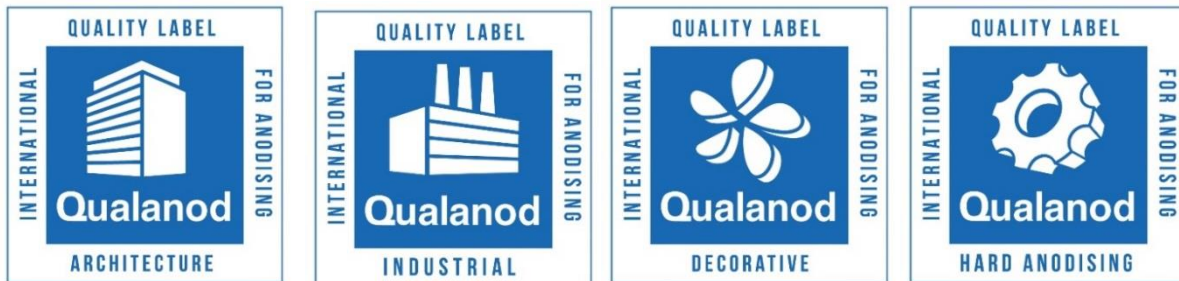
a) Label for architectural anodizing