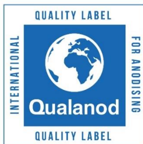
f) Generic label