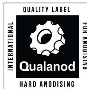
e) Example of a label in black and white