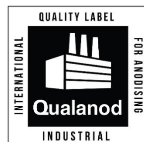
h) Example where the inner motif of a label is stamped or printed directly onto adhesive tape or stickers

PEARY LTD OPEX STREET ANNATOWN RESPUBLICIA